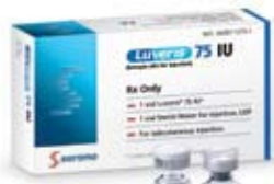
Luveris® diluent Luveris® powder

1. Make sure you have all the necessary materials assembled in a clean area: one Luveris® 75 IU vial, one vial with sterile water (diluent), one syringe, two needles, alcohol swabs, gauze, bandage, sharps bin. (The syringe, needles, alcohol swabs, gauze, bandage and sharps bin are not included in the Luveris® package.)